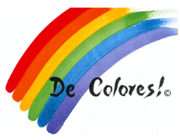
<u>This Photo</u> by Unknown Author is licensed under CC BY-NC-ND

Go here to view news of upcoming events, read the current month's Ark or download forms.