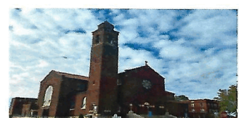
The Basilica & National Shrine of OUR LADY OF CONSOLATION The Conventual Franciscan Friars of the Province of Our Lady of Consolation 315 Clay St, Carey, OH 43316

Chapel Open Wednesdays & Sundays from 10:00am to 2:00pm with Mass at 11:00am; Grounds Open Every Day from 9:00am to Dusk