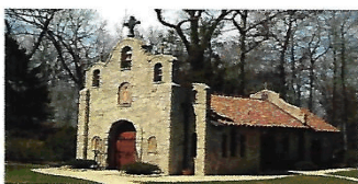
PORTIUNCULA On the Motherhouse grounds of the Sylvania Franciscans 620 Convent Blvd, Sylvania, OH 43560