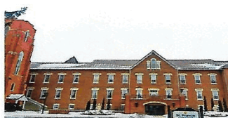
MOTHERHOUSE EUCCHARISTIC CHAPEL On the grounds of the Tiffin Franciscans 200 St. Francis Avenue, Tiffin, OH 44883

Chapel Open Wednesdays & Sundays from 10:00am to 2:00pm with Mass at 11:00am; Grounds Open Every Day from 9:00am to Dusk