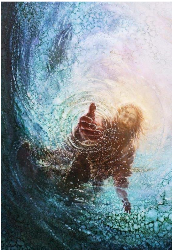
DeColores. Christ's peace and blessings be upon you! May His love surround you!

through us and allow us to love others as He loves us.